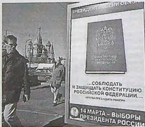
ABB: How many people according to official sources gave their votes to Putin?

This time the militia didn't make any trouble and the biggest problem for the movement against elections appears to be the official propaganda machine.