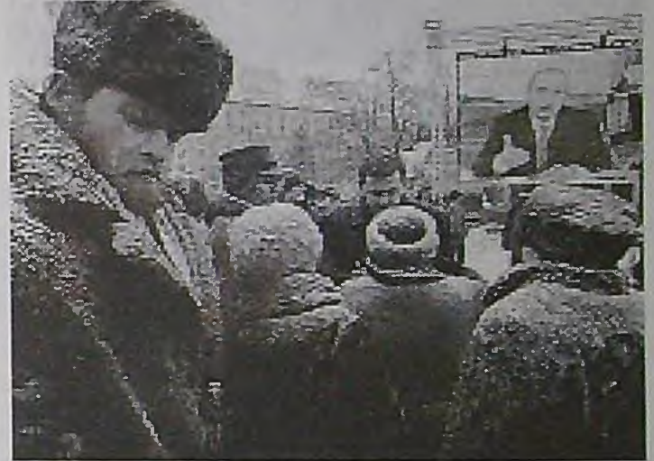
ABB: Don't you think that perhaps many Russians have dreams of great Russia, like the tsars or stalin?

voters or for the parliament. Post-soviets don't see much use in elections. Totalitarianism is dangerous for what? Freedom? The majority considers that they don't have money in order to make use of freedom.