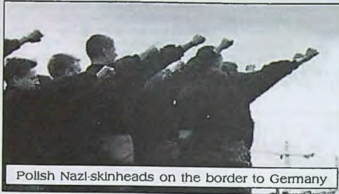
Polish Nazi-skinheads on the border to Germany

This is kind of background. Lets take a closer