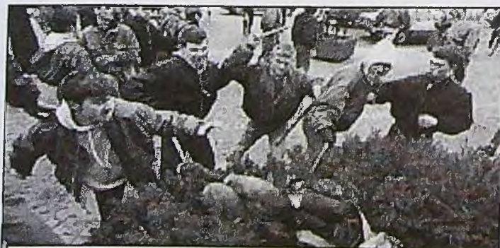
Nazi-skins in attack on "legalize Marijuana" demo

Its a main far right party in Poland, with strong representation in government. They are alliance of smaller right wing parties. Majority of them are fanatical catholics and anti-abortion fundamentalists. Many of them are also quite openly anti-semites, their main guy in Parliament Roman Giertych, comes from party called Stronnictwo Narodowe (National Faction), which is openly fascist (of course without using this unpopular word "fascism"). Now they plan to start in elections to European Parliament. Before EU voting in Poland they presented anti-EU