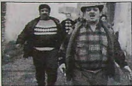
Social explosion in Eastern Slovakia

Slovakian government tries to play with a racist card to prevent a possible generalization of this class struggle movement.