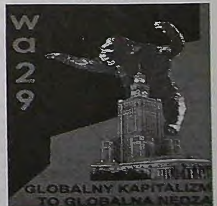
ABB: Thank a lot and see you soon in Warsaw!

Recently (14.03) organisers decided to move planned summit from previously accepted Palace of Culture and Science into hotel "Victoria" as this object suppose to be easier to defend. The idiots got scared of their own propaganda, so we can see it as first our success, even without much of our involvement. On the end I will like to invite all of you to Warsaw for these days. 28 th April we plan more relaxed day with street theaters, happenings. next day big demonstration and 30th will depend on that what happened previous day - maybe we will make some next demo or few small - group actions. We shouldn't forget that immediately after is 1st May, when Poland suppose to join EU. Street party is planned and demonstration against EU.