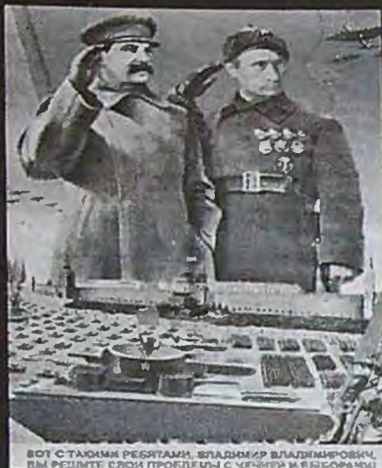
With this boys, Wladymir, you will solve yours problems, war in Chechnya and elections!

Wladymir Putin won elections in Russia. This is not odd, because he was the only one candidate, which has unrestricted access to television, press and radio. In electoral programs PR-specialists built his portrait as strong and competent man. Some artists wanted to discredit this propagandist theatre. In our gallery we present some anti-electoral and anti-putin posters. Unfortunately, only few electors could see them before the elections.