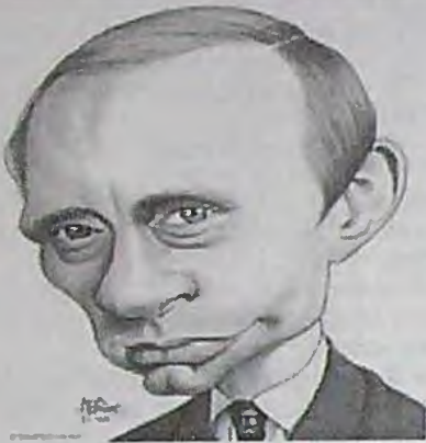
ABB: Who is actually ruling in Russia? For sure not a society, but then who? Is it Putin and his closest spectrum or completely different groups of powerful people? Maybe the guys from military and secret service headquarters, or simply mafia in cooperation with the most powerful Russian business people? Does anybody in Russia know the answer to this question? Have all those executed journalists in the last years been the ones who found the right answer to this question?

Russia was governed by bureaucrats and other different clans all the time. By Russian constitution, large amounts of power is concentrated into the president's hands. In the first period he consolidated his own position with new members in government from old KGB members. Before elections, some re-organisation in the government gave Putin the right to exert