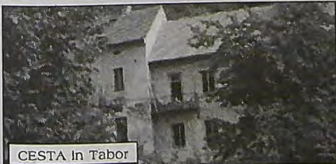
CESTA In Tabor

You are welcome to benefit your workshop / lecture / training to the programme. Please fill for that the workshop application form.