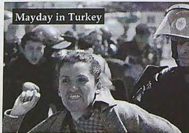
Mayday in Turkey