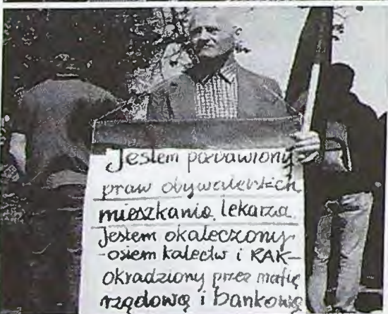
Deprived of civil rights, flat and doctor. Robbed by "government-bank mafia"