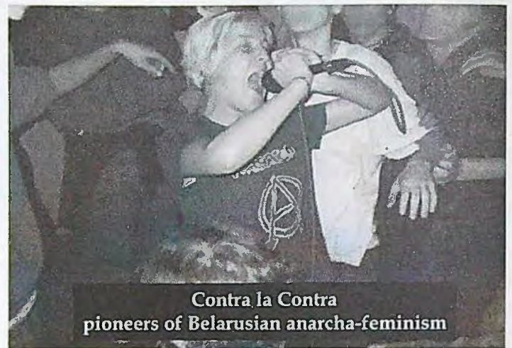
Contra la Contra pioneers of Belarusian anarchy-feminism