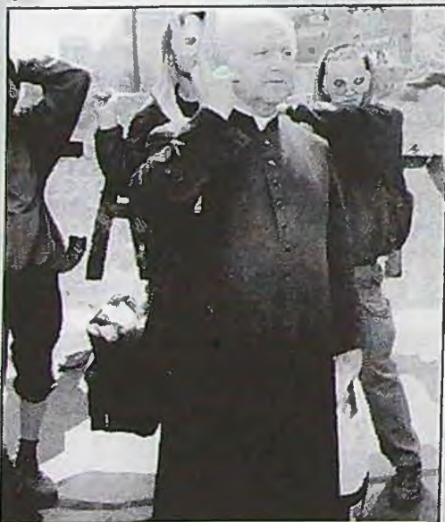
Bl@ck Block a`la Pologne

picture from alterglobalists march in Warsaw during the anti-EEF-summit Wa29